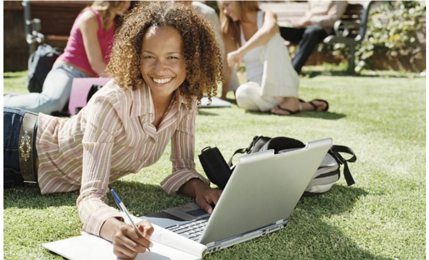
With a modern relational database at the center of its Web architecture, accessing and using applications is easier and more efficient for students and administrators at the University of Miami.

Lower licensing fees and TCO; ability to tap existing skills set at UM and recruit from current database administrator (DBA) market; agile and flexible infrastructure for developing more secure Web applications; improved user access to applications; streamlined business processes and improved productivity